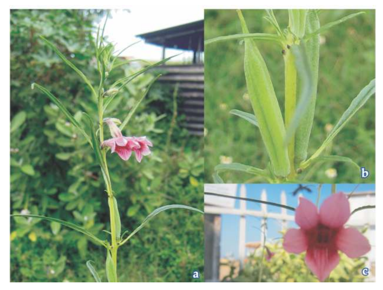
Plate 2 Figures (a-c) a. Habit, b. Capsule, c.Flower.

district, Kollam Beach (8°87'65.04"N, 76°59'22.38"E), 13.5m, 6.6.2011.